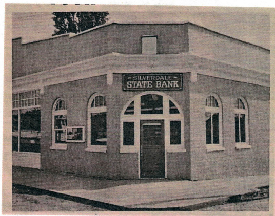
Silverdale Breeze , 29 September 1965.

Below, Newspaper, Silverdale Breeze , Wednesday, 29 September 1965.